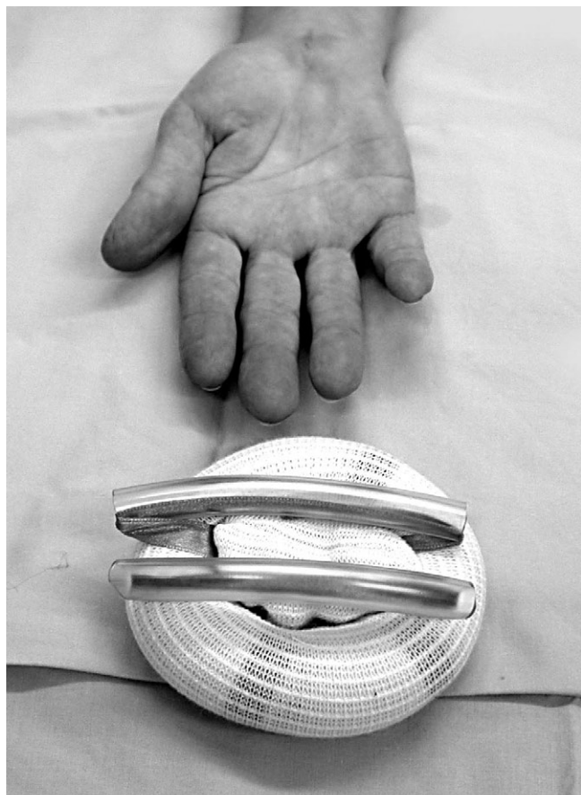
Figure 1 The S-MART™ device.

The S-MART™ (OHK Medical Devices – Division of Oneg HaKarmel Ltd., Haifa, Israel) is composed of an elastic silicon ring with an inner diameter of 52mm and outer diameter of 76mm, wrapped in an elastic tubular stockinette sleeve and two straps, each ending in a pull handle (Fig. 1)