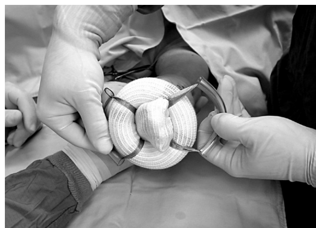
Figure 2 The surgeon places the ring on the fingertips and then pulls the two straps proximally.

The device is provided sterile and double-packaged. It is applied to the limb after skin preparation and draping by placing the ring on the fingertips, and then pulling on both handles proximally (Fig. 2).